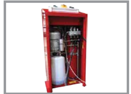
▲ Volumetric Control