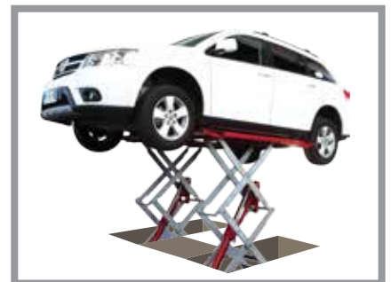
▲ Flush or Surface Mounted