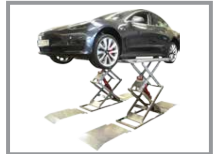
▲ Extended Ramps for low clearance vehicles and Hot-Dip Galvanization as optional accessories