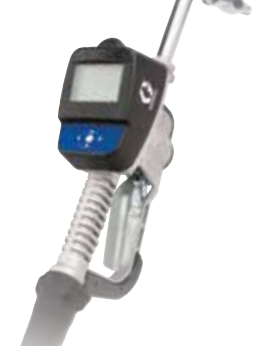
SDM and SDP Meters