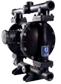
Husky™ Diaphragm Pumps