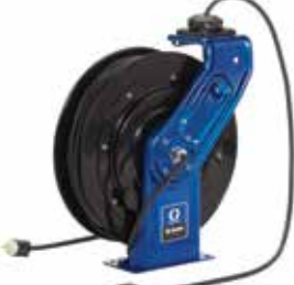
SD Cord and Light Reels