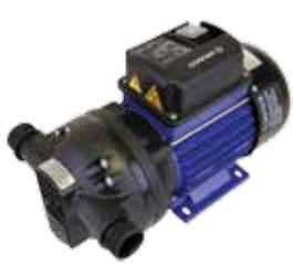
LD Blue Electric Pumps