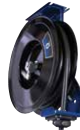
SD Series 10/20