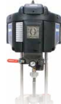
NXT™ Supply Systems