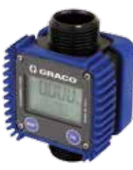
LD Blue Meter