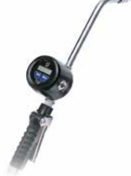
XDM6 and XDM12 Meters