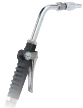
SDV15 Control Valve