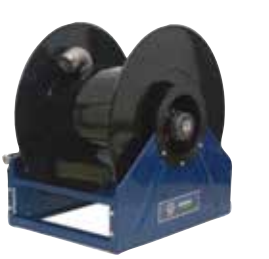
XD Series 60/70/80 Powered Reels