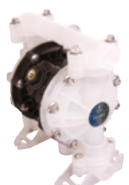
SD Blue AODD Pumps