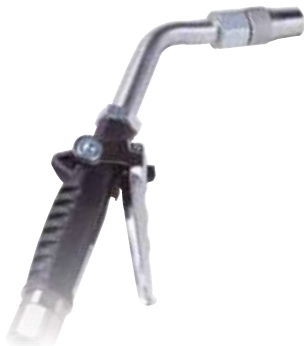
XDV20 Control Valve