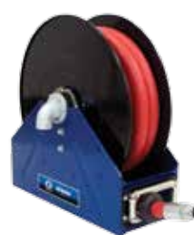
XD Series 40/50