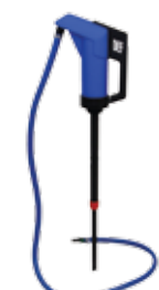
LD Blue Manual Pumps