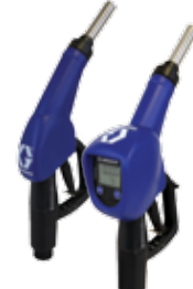
LD Blue Automatic Dispense Nozzles