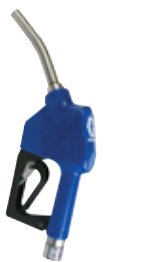
SD Blue Dispense Nozzles