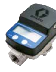
SDI15 In-Line Meter