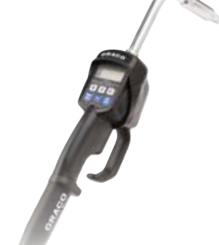
LDM and LDP Meters