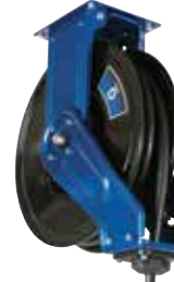
XD Series 10/20/30