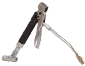
Pro-Shot Control Valve