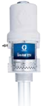
Mini Fire-Ball® 225